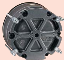
Back view shows flush mounting adapters.